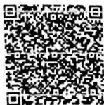
Registrar Pharmacy Council